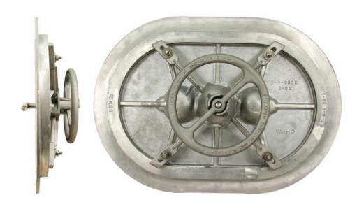
BFHQTH15X24A/A with Optionanl Handwheel

This hatch is ABS Certified for use on ABS classed vessels or facilities by the American Bureau of shipping.