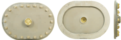
Model: BMHC15X23Z - Weld Stud, Combo A