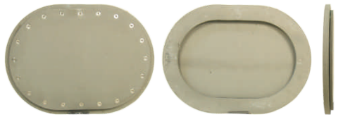
Model: BMHC15X23F - Flush Screw