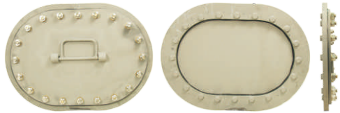
Model: BMHC15X23BZ - Weld Stud, Combo B