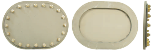
Model: BMHC15X23S - Weld Stud