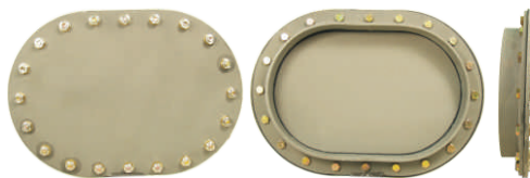
Model: BMHC15X23# - Raised Combing, Combo B See Additional Models on Manhole Matrix.